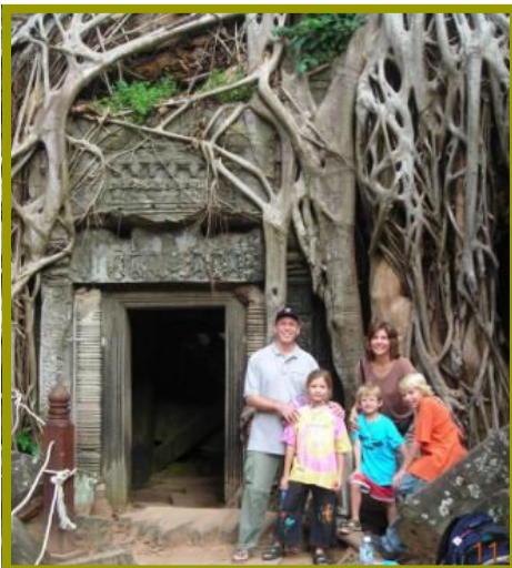
November 2007—a visit to Siem Reap

We are truly blessed to have such strong ties here in America. We as parents have had a good chunk of time given to reflection on our time in Cambodia and how God is working in us. It's been a HUGE blessing to have this time and see God at work. Check out our updated website with new furlough pictures!